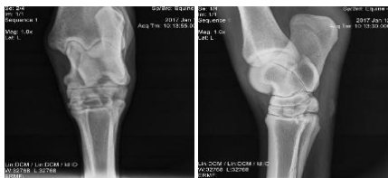
Digital Radiograph Hock Set 2 Views of each hock